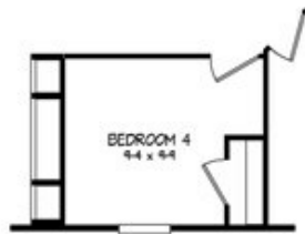
OPT BEDROOM #4 REPLACES FORMAL DINING ROOM